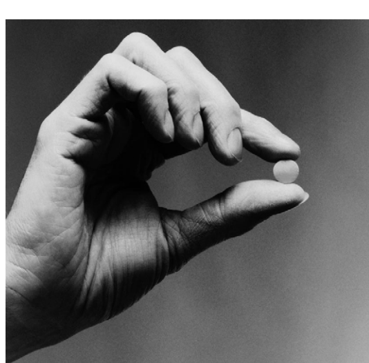
A green placebo?

World War II has been called the great divide in medical research and certainly, for the placebo, this is true. In fact, the "powerful placebo" was born in the vortex of one of medicine's most momentous transitions. Before